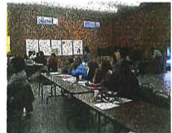
Kitselas Members attend treaty meeting

Treaty office has been discussing the importance of keeping the people of Kitselas informed about the ongoing treaty negotiation. The staff at the treaty office have been considering meeting with individual family groups to discuss what concerns they have about the Treaty negotiation.