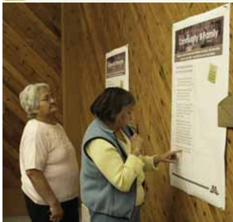
Community members broke out into groups to discuss the future of Kitselas