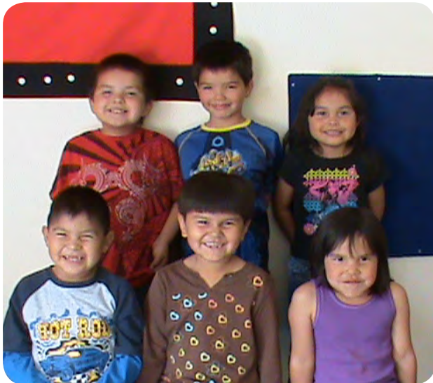
PM Head Start Class

Congratulations to all of the 2010 Kitselas Graduates