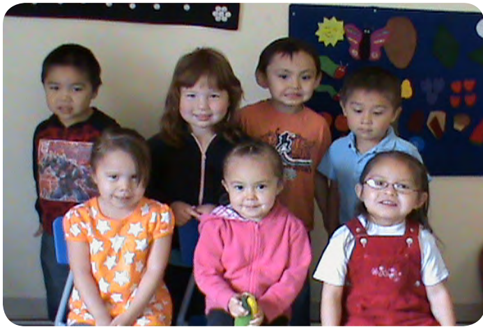
AM Head Start Class