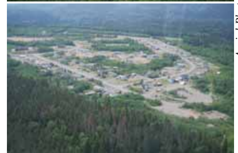
Aerial Photos of Gitaus